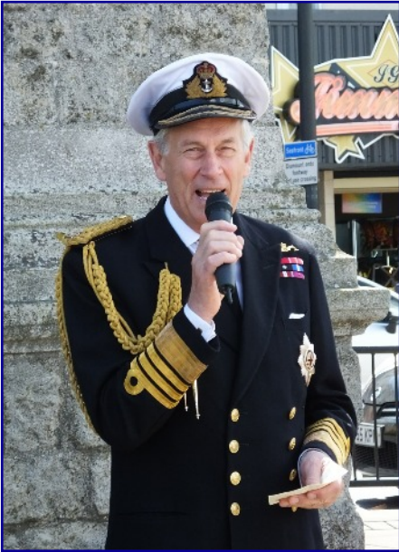
Admiral the Lord Boyce KG, GCB, OBE, DL, Lord Warden of the Cinque Ports