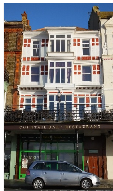
Rickus Restaurant, 44 High Street/ 16 Marine Drive, Margate