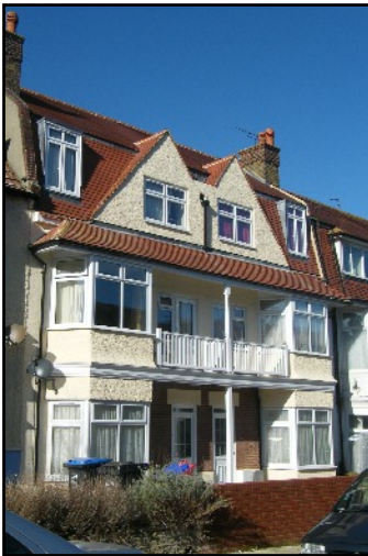
50 & 50a Surrey Road, Cliftonville