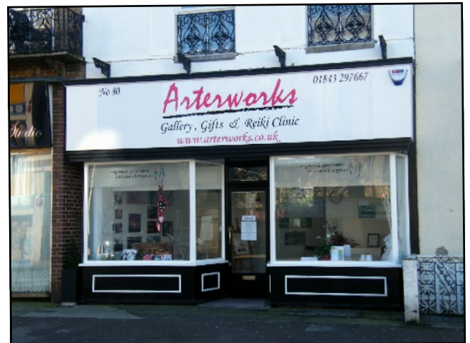
Arterworks Gallery, 80 Northdown Road, Cliftonville