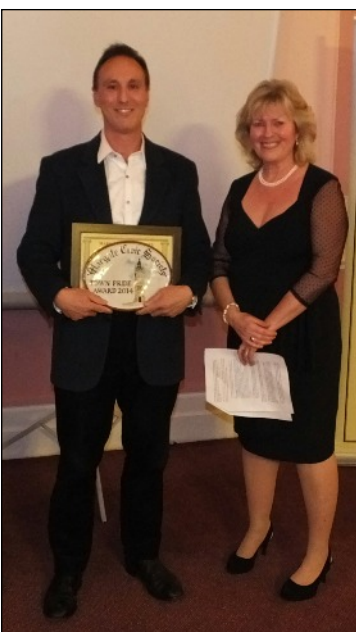
The Sands Hotel, 42 High Street/ 15 Marine Drive, Margate