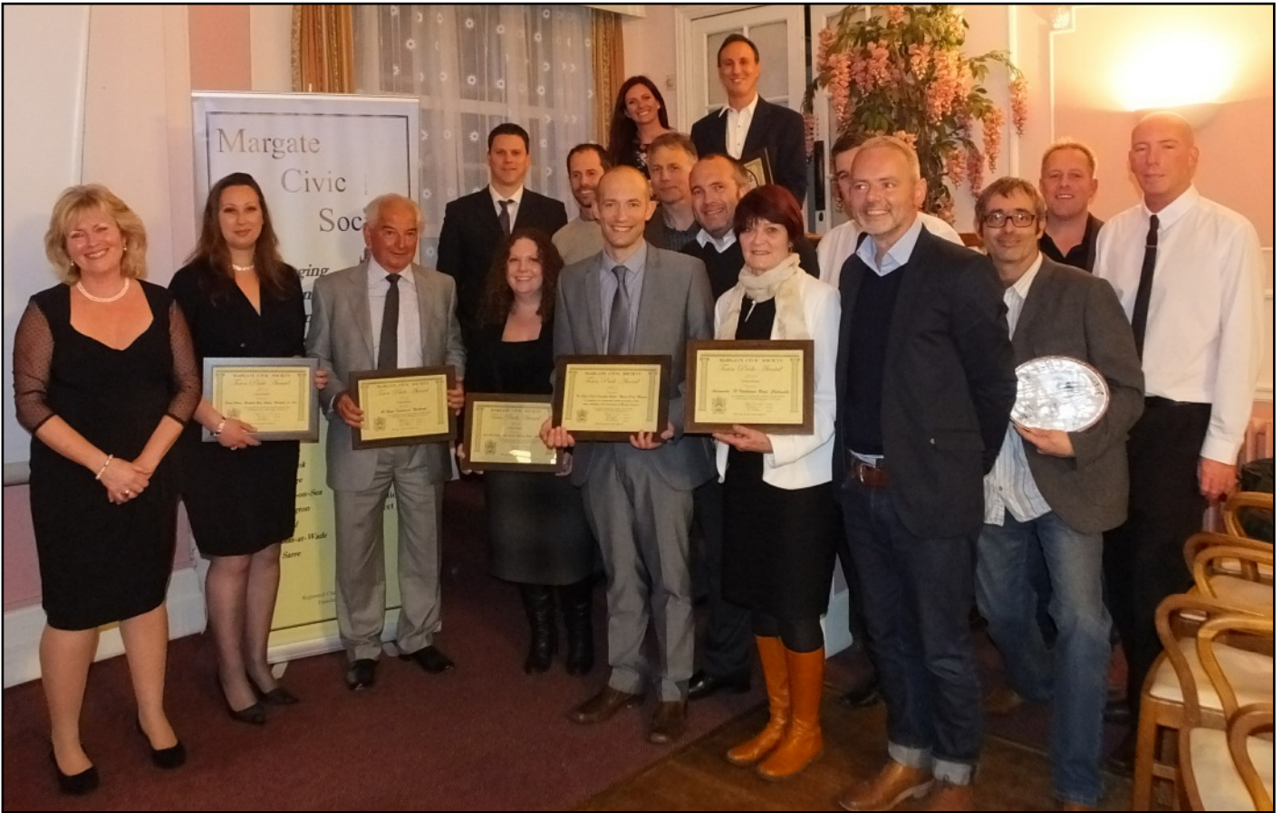
The group photo taken at the end of the presentation of the 2014 Town Pride Awards