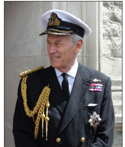
Admiral the Lord Boyce, Lord Warden and Admiral of the Cinque Ports, officiating at the Clock Tower