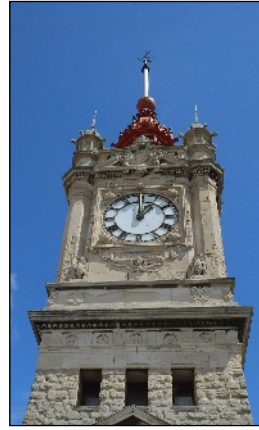
The Time Ball descends rapidly on the pole...