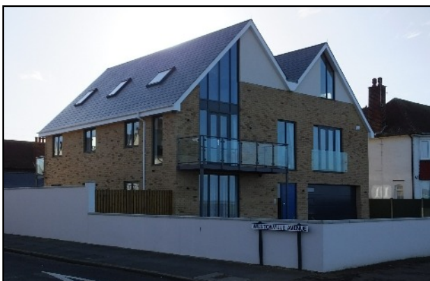
25 Royal Esplanade, Westbrook