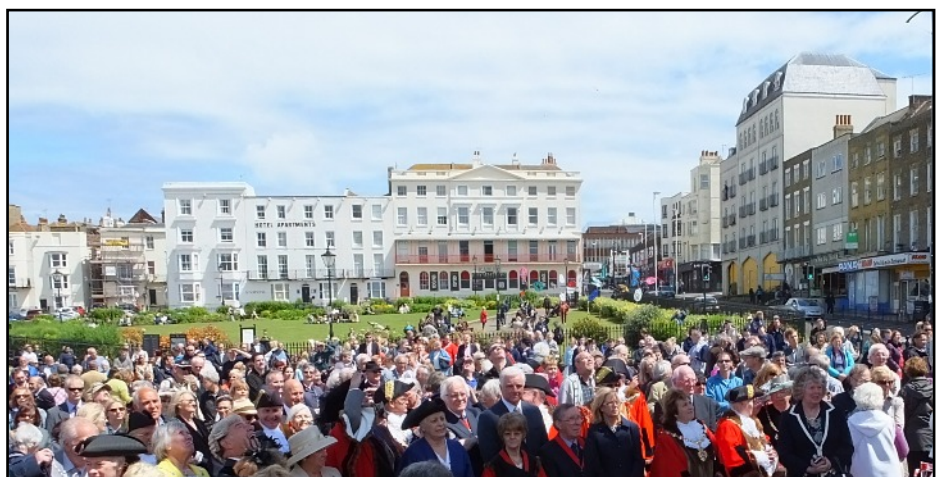
A large number of the townsfolk, as well as civic dignitaries, came out to support the occasion as can be seen from the above photograph