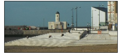
The Steps, Marine Drive