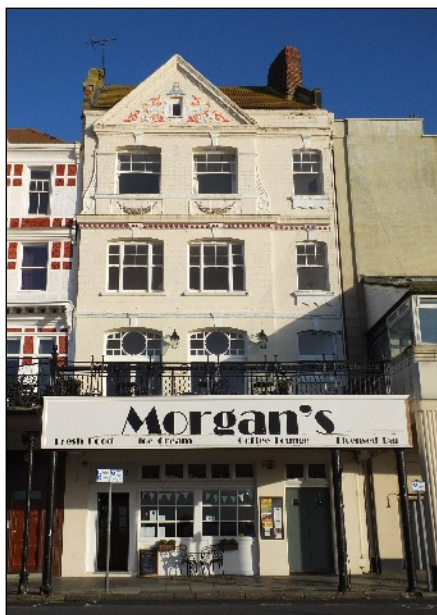
Morgan's Vintage Dance Hall & Coffee Lounge, 46 High Street/ 18 Marine Drive, Margate