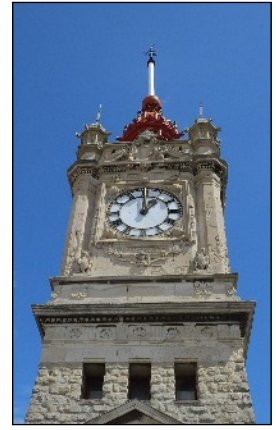
...to rest at the bottom of the pole until the same time tomorrow