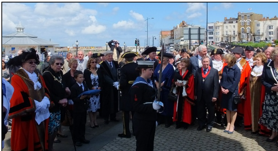
Civic dignitaries from numerous towns around Kent arrive for the ceremony