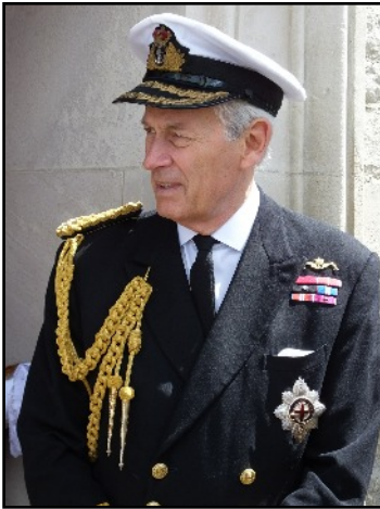
Admiral the Lord Boyce, Lord Warden of the Cinque Ports, officiated at the ceremony as the representative of HM The Queen

These photographs capture some of the moments during the ceremony at Margate Jubilee Clock Tower and at the reception held afterwards at The Sands Hotel. The photographs record for posterity the undoubted success of Margate Civic Society's commemoration of the Diamond Jubilee of Queen Elizabeth II's Diamond Jubilee. The ceremony took place exactly 125 years after the Clock Tower was opened on Queen Victoria's 70th birthday - namely 24th May 1889.