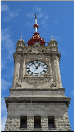
At five minutes to one o'clock, the Time Ball is at the half-way point on the pole