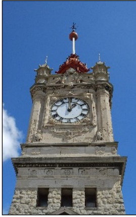
Just before one o'clock, the Time Ball is raised to the top of the pole