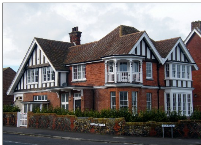
Forest House, 26 Westgate Bay Avenue, Westgate-on-Sea