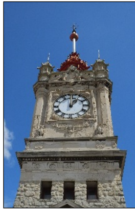
At one o'clock precisely, Time Ball begins its descent on the pole