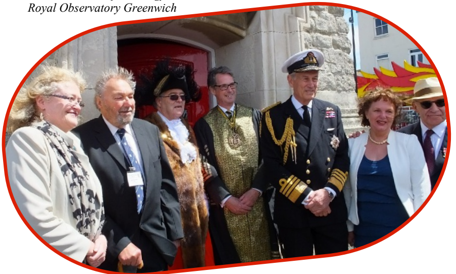
A group photograph of the VIPs taken in front of the door to the Clock Tower